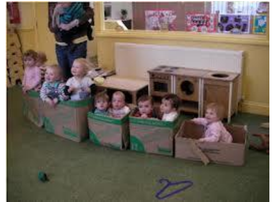
Jesus Calms the Tempest

At one time when Jesus had entered a ship to cross the Sea of Galilee with His disciples, a great storm arose and the waves nearly covered the little vessel, so that they were apparently in great danger.